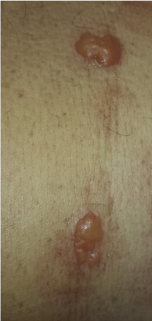
Fig. B. Multiple bullous lesions filled with material resembling exuda.