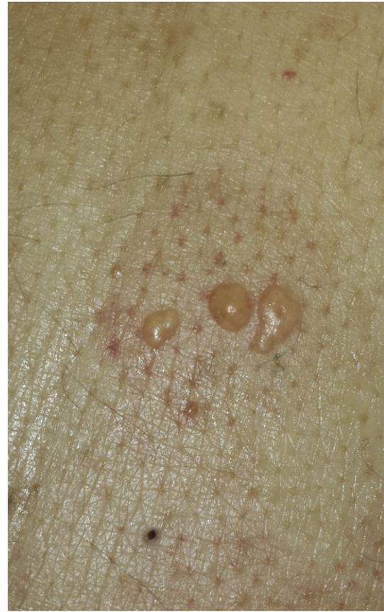
Fig. C. Multiple bullous lesions filled with material resembling exuda.

was reported in the other organelles including mitochondria, endoplasmic reticulum and free ribosomes. 10,11